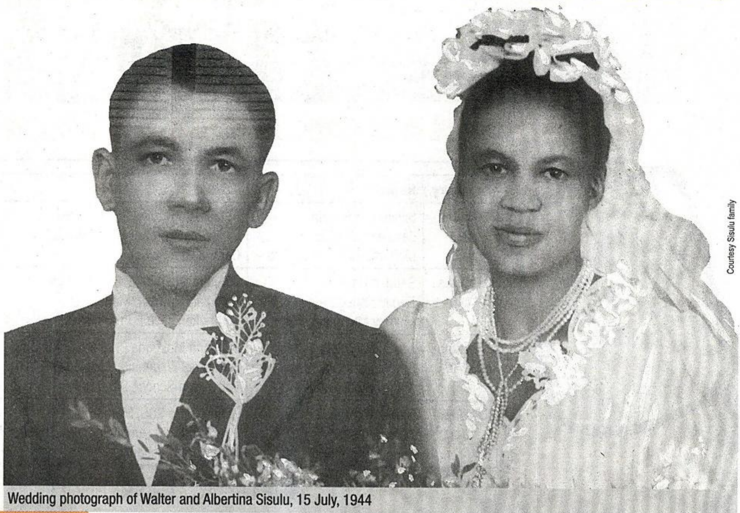
Wedding photograph of Walter and Albertina Sisulu, 15 July, 1944

In 1939 Albertina moved to Johannesburg to work as a trainee nurse. In the city she was confronted with the racial prejudices and injustices that she committed to exposing and removing. It wasn't long before she met Walter Sisulu, whom she was to marry in 1944. Their lifelong partnership was testimony to their commitment to one another and to the struggle for freedom.