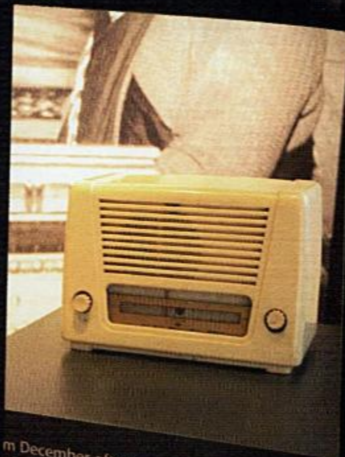
In December afternoon in 1961, Nelson Mandela was sitting in this kitchen. On the radio, a news bulletin announced that Albert Luthuli, President of the ANC, had been awarded the Nobel Peace Prize.